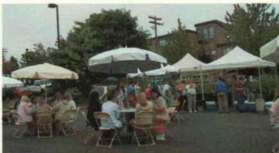
Everyone enjoyed visiting with their fellow healthcare workers.