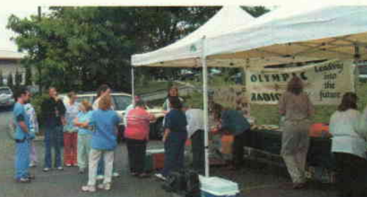
Waiting in line for a goody bag & to sign up for door prizes.